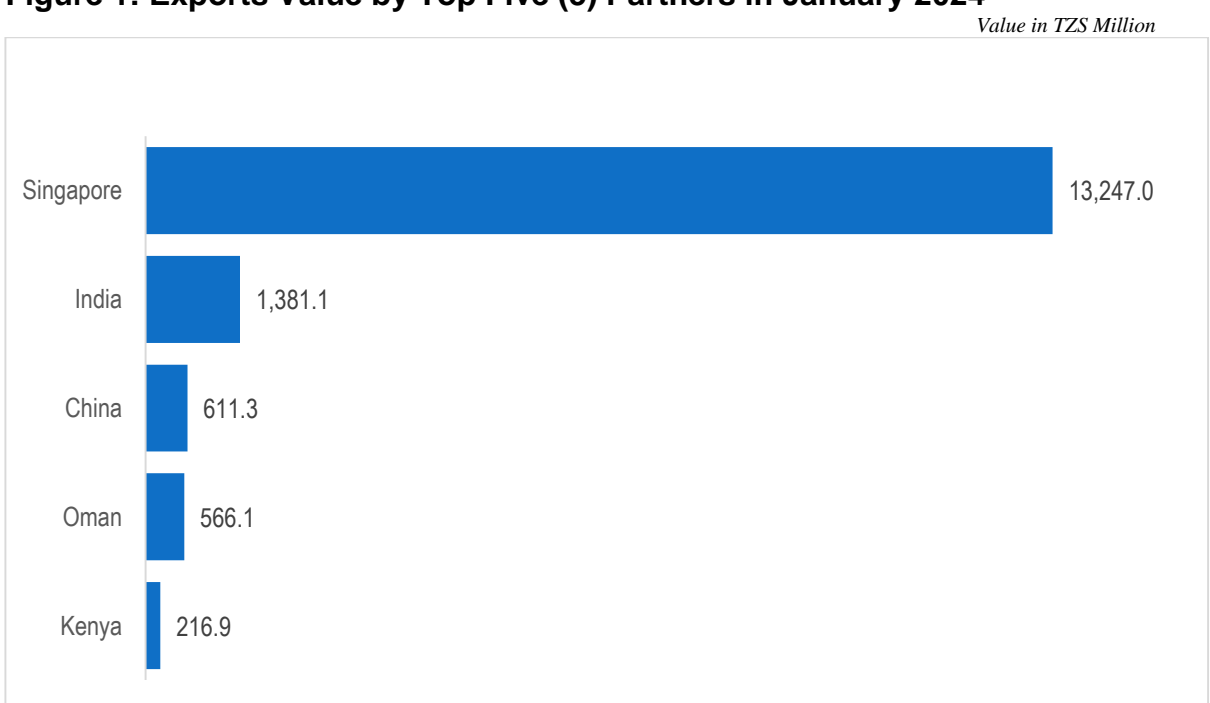
Figure 1: Exports Value by Top Five (5) Partners in January 2024